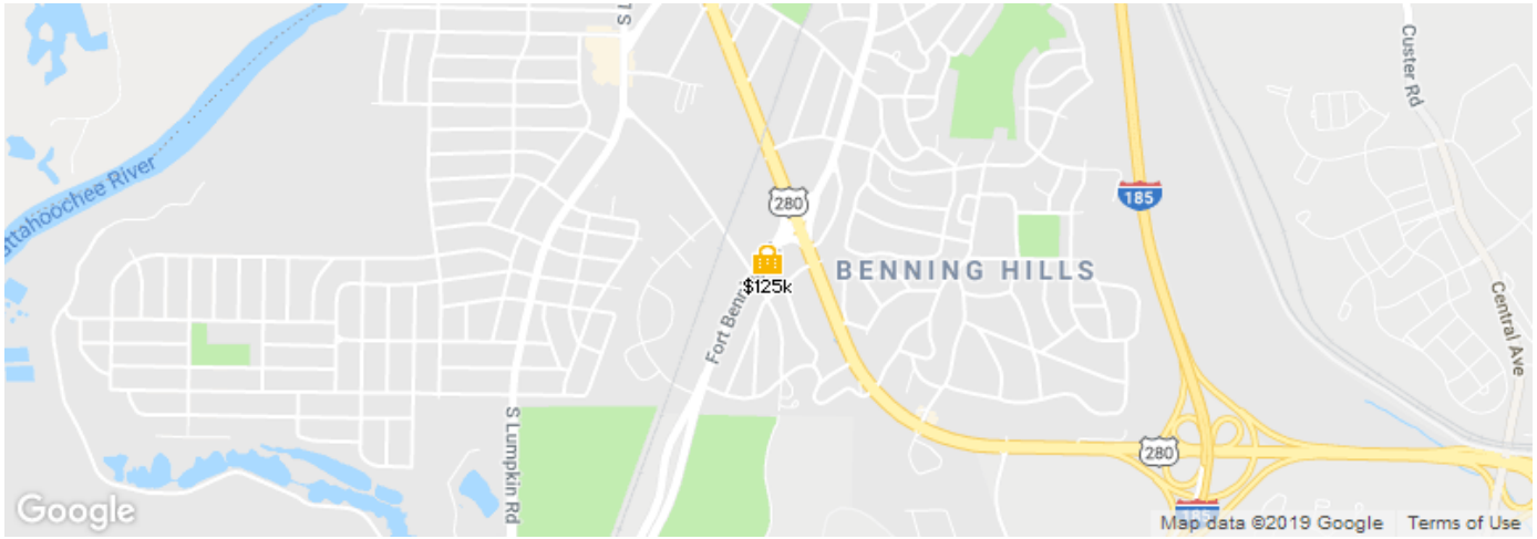
Legend: 🏠 Subject Property